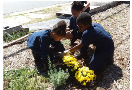
School field trips