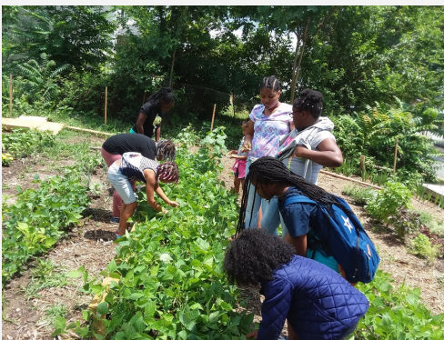
Boys & Girls Club - 2019 Garden Club

In an effort to reach more people, I have created several sets of Garden Plant Cards.